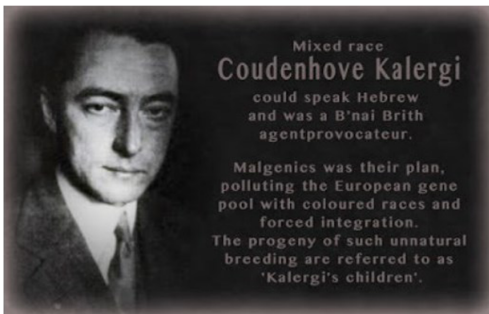
The Coudenhove-Kalergi plan - To Genocide Indigenous Europeans in Europe

Sources: HumansAreFree.com ; PseudoReality ; BibliotecaPleyades ;